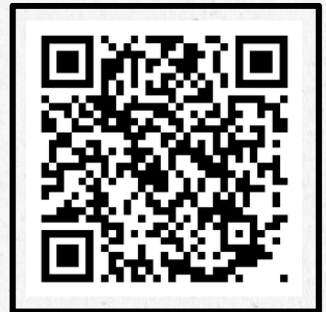
QR Code for Demo Testimonials

Let technology take care of operations while you take care of your guests.